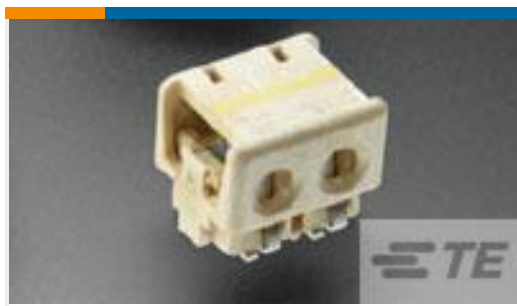
TE Part # 3-2106003-1 Connector, SMT-IDC, 1 POS, 24 AWG